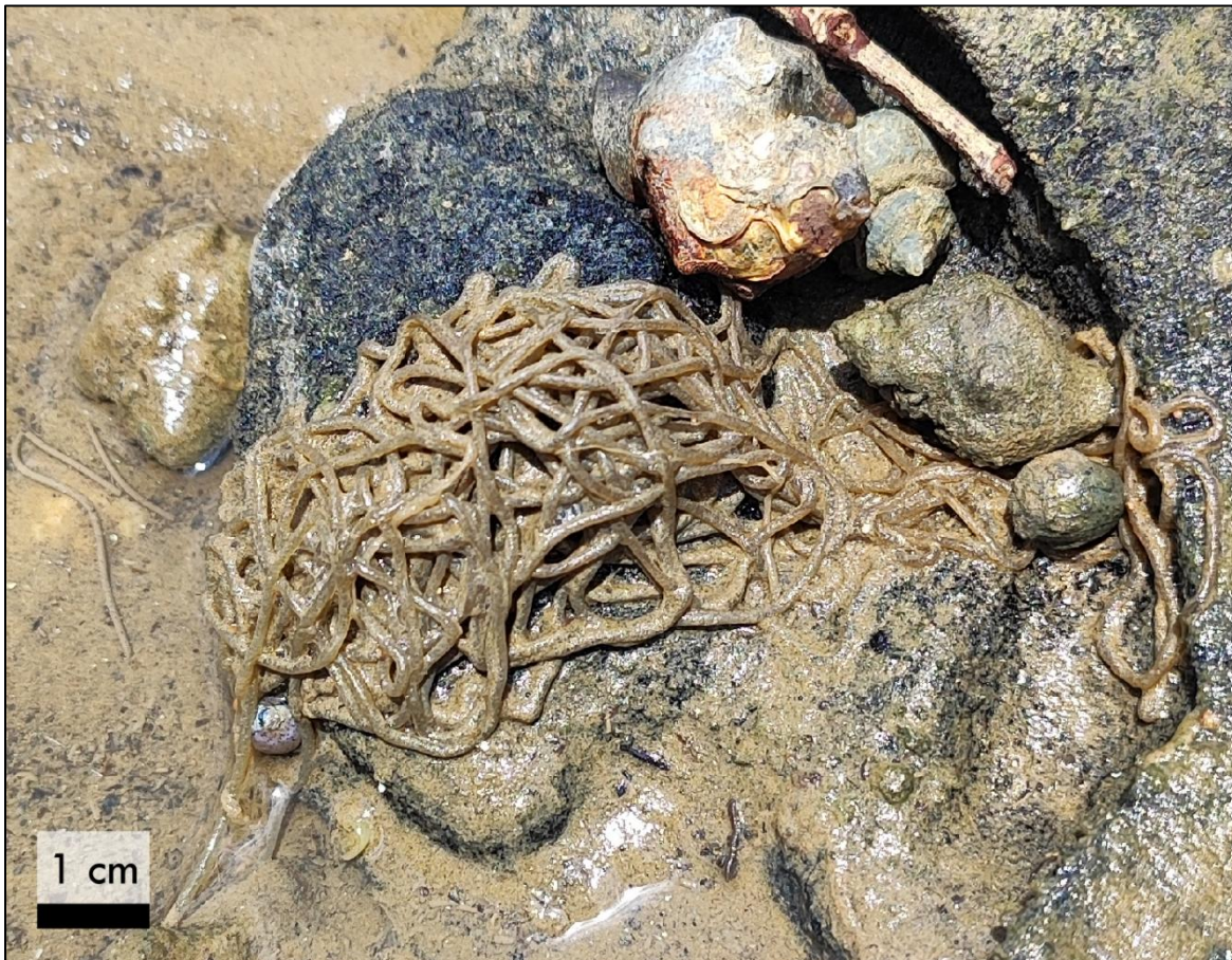
Figure 2. Egg masses of B. leachii recorded at the mouth of the Sergipe River on a rocky substrate.