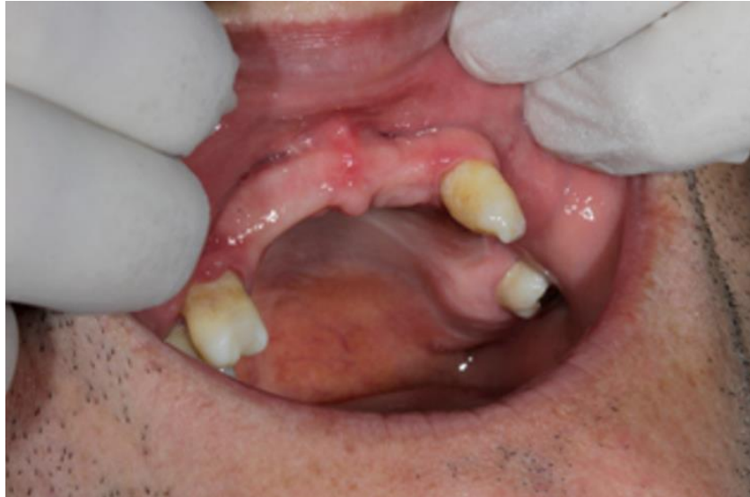
Figure 1. Condition of soft tissue with signs of trauma in the palate and at the back of the vestibule.