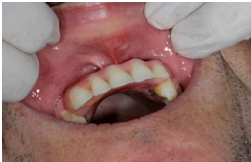
Figure 2. Prosthesis in position.