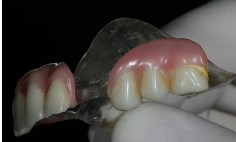
Figure 3. Unsatisfactory condition of prosthesis, indicating worn acrylic resin, short teeth, and accumulation of food remains.