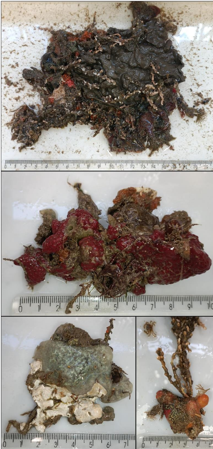
Figure 5. Photographs of some colonies of Carijoa riisei (Duchassaing & Michelotti, 1860) covered by tunicates and sponges collected in the Vaza-Barris estuarine region. Scale in centimeters.