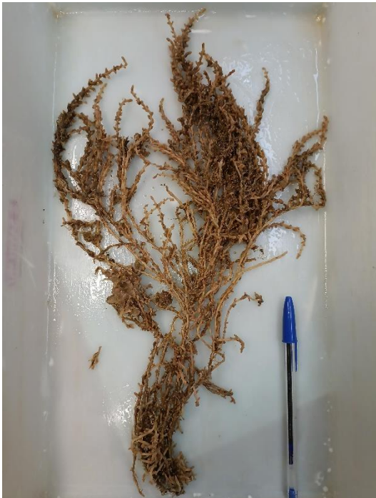
Figure 3. The longest colony of Carijoa riisei (Duchassaing & Michelotti, 1860) collected in the Vaza-Barris estuarine region in comparison to a pen (15 cm long).

Densely branched colonies were present throughout the whole pier substrate with > 90% coverage (visual estimate). These colonies arise from basal stolons and comprise numerous axial polyps, up to 40 cm long and 0.15 cm in diameter, reaching up to the third order (Figure 3).