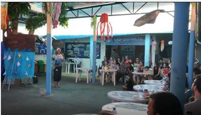
Figure 5. Moment of reflection and conversation with the public.

After the presentations, there were dialogues, questions and comments from the audience (Figure 5).