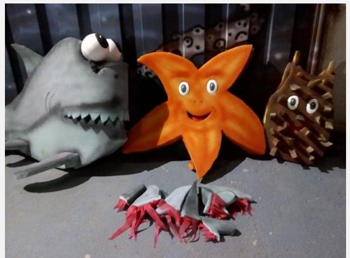
Figure 3. Material made to explain the cruelty of the cruel practice of "Finning".

Entitled "Tubi & Cia contra Jack Spirro", the play featured the characters: Jack Espirro (pirate), Tubi (shark), Star and Ouro (representing the "Cia" group of echinoderms through the female presence).