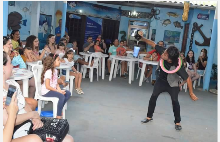
Figure 6. Senic art - magic and balance - of the watter bottle and glass by Jack Spirro

The expertise and performance of artistic activities such as juggling, magic, balance, among others, contributed to the success of the play (Figure 6).