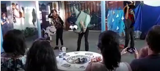
Figure 4. Shark dance finalising the artistic and environmental piece.

balance of the ocean - considering Star and Ouro's defenses to defend Tubi.