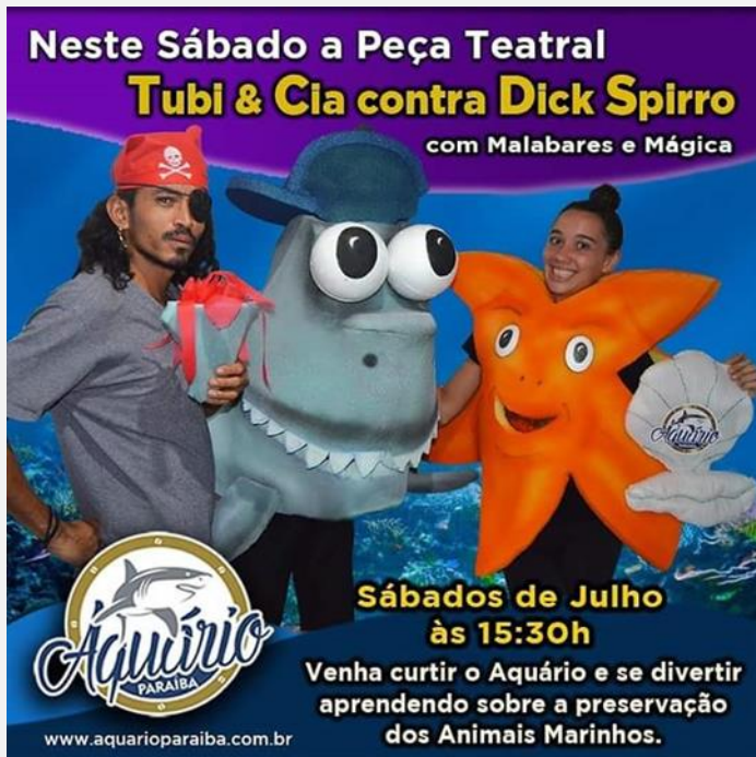
Figure 7. Announcement of the attraction on the aquarium's social networks and website.

The play took place on Saturdays in July, at 3.30 p.m. and lasted an average of 30 minutes (Figure 7).