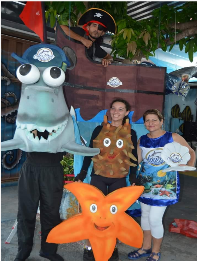
Figure 2. Scenographic production made of reusable or recycled materials.

As this is a pilot project with conservation precepts in a space that has as its pillar the education for sustainability, the scenographic production was made of reusable or recycled materials to raise awareness of the spectator with respect to the theme of solid waste (rubbish), but also of the team itself, reinforcing the participation of the technical team and actors/artists towards a new way of thinking the ocean environment (Figure 2).