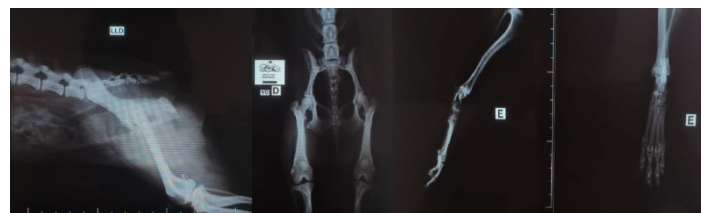
Figure 1. Radiographic images in lateral/ventrodorsal projections of the right hip joint and mediolateral/dorsoplantar of the left pelvic limb. Evidencing discrete joint degeneration suggestive of dysplasia and possible right patellar dislocation.

The radiographic examination was performed in the lateral and ventrodorsal projection of the hip joint (Figure 1), in which there was a finding suggestive of (discrete) subluxation of the right hip joint, associated with a slight indication of DJD that may be directly linked to dysplasia. Findings suggestive of tendon injuries (tendinopathy) and possible right patellar dislocation were also seen. At clinical criteria, more additional radiographic projections were suggested for better diagnostic elucidation. Then, a mediolateral and dorsoplantar projection of the left pelvic limb was performed, in which there were no clinical findings of importance for the characterization of the case.