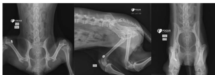
Figure 4. Radiographic images in the ventrodorsal projections of the pelvis region and right-side showing swelling in the knee region, suggestive of loosening of the extracapsular orthopedic buttons.

However, on November 7 th , 2020, the patient returned to limp and a new image exam was carried out. The projections performed were direct lateral and ventrodorsal of the pelvis region. And the diagnostic findings were an increase in soft tissue volume in the lateral region of the right pelvic limb – adjacent to the knee joint (Figure 4).