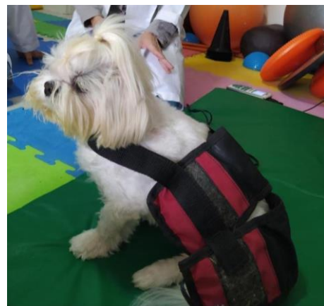
Figure 5. Patient during Magnetotherapy session.

Electrotherapy is the application of an electric current through the skin as a form of treatment. When applied through Transcutaneous Electrical Nerve Stimulation (TENS), it aims to control pain, being considered a non-invasive and easy-to-use therapy, indicated for the control or relief of pain with acute and/or chronic characteristics (SLUKA; WALSH, 2003).