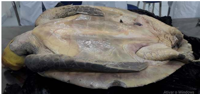
Figure 2 - Fracture at the edge of the hull.