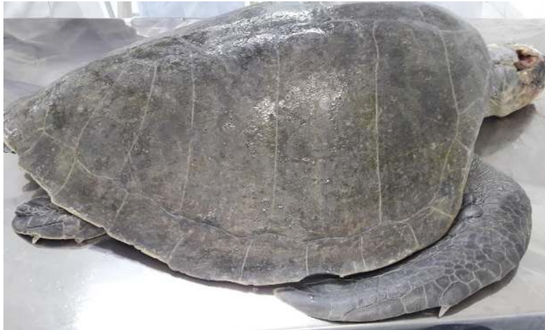
Figure 1. Chelonian's carapace.