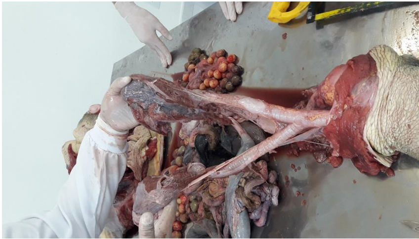
Figure 7 - Trachea