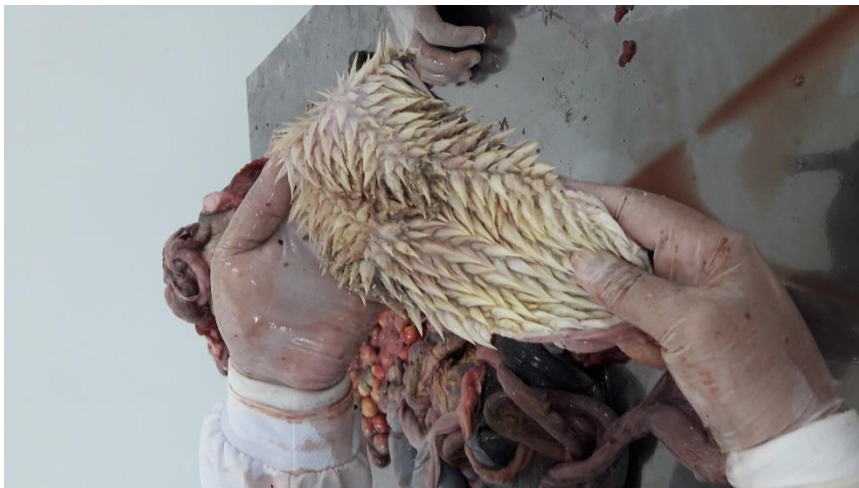
Figure 8 - Particularity of the esophagus.