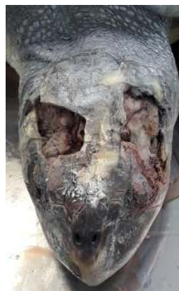
Figure 3 - Fracture in the skull of the turtle.