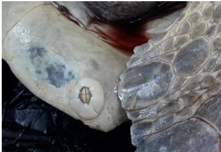
Figure 4 - Barnacle in the ventral part of the carapace.